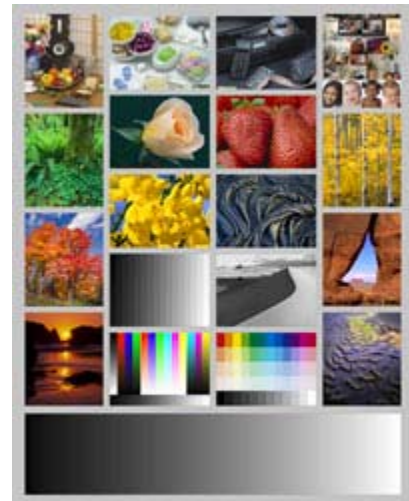
Bill Atkinson's test image. Used with permission.

Prints were made using the High Quality setting within a color-managed workflow. Inks were changed only when the printer stopped and indicated an empty tank. At the 200 th print, a count was made of ink cartridges used plus an estimate of remaining ink cartridges. From that information, total use of ink in equivalent number of ink cartridges used was obtained. The ink usage was equated to amount per square inch and then converted to specific photo sizes.